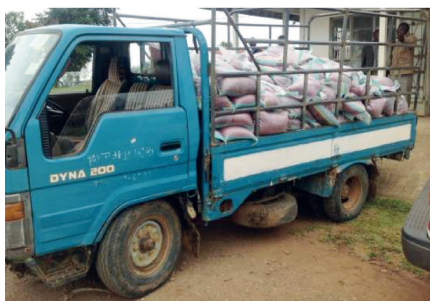
NAADS beans procured through procurement process ready for distribution to farmers in Kashenshero Sub County, Mitooma District

The MAAIF is a regulator of both importers and distributors of inputs to farmers directly through; lower local governments; service providers such as nursery operators, agro-dealers and distributors, and cooperatives whose responsibility is to ensure timely delivery of all inputs to farmers.