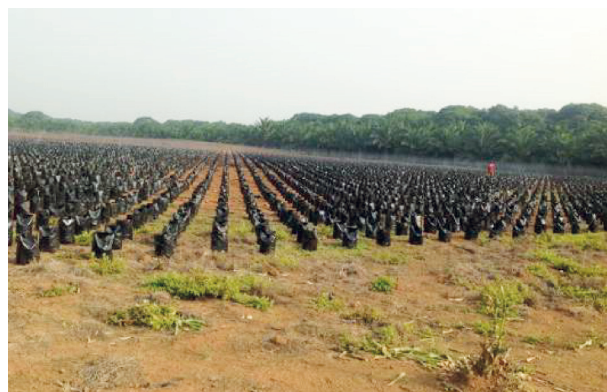
Imported palm oil seedlings raised in nursery bed at OPUL nucleus estate before distribution to farmers in Kalangala.

Inputs sourced under NARO are produced at research centres and later distributed to farmers for multiplication. Projects that source inputs under the private sector such as the Cotton Development Organization, buy inputs from ginners and distribute them to farmers at a subsidized price