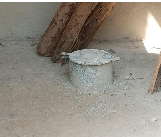
L: A protective structure and fencing for a surface water monitoring station for Aswa 1 in Otuke district; R: A drilled well for a ground water monitoring station in Kaliro District

The aquifer system for Nakasongola was assessed to 60%. That is Aquifer and Aquitard characteristics to get the status of Ground Water within the area since it lies in the water-stressed zone. This was done by assessing porosity through carrying out geophysical well logging,