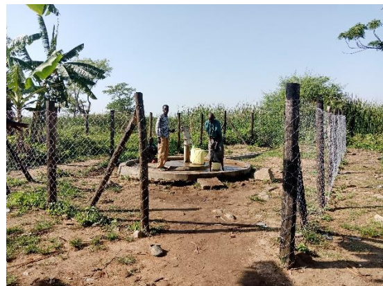
L: A tree nursery in Toroma Town Council where all seedlings were distributed; R: A water source protection by fencing of a borehole in Palam Sub-county, Katakwi District

A contract has been signed with the consultant to undertake range land management planning. Start-up meetings for the consultant, and reconnaissance field trips were held in sub-catchments and the final inception report for the preparation of the rangeland management plans was submitted and reviewed. Terms of reference (ToRs) for the development of 2 climate smart catchment management plans were developed and undergoing review before submission to the Contract's Committee.