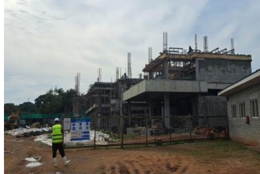
Ongoing construction works at National Water Quality Reference Laboratory in Entebbe