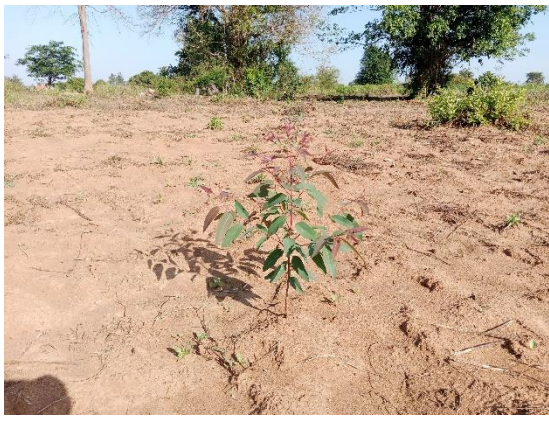
L: A percolation trench for flood control in Ngariam Parish; R: A degraded landscape planted with Eucalyptus tree seedlings on an acre of land in Aliakamere Parish both in Katakwi District