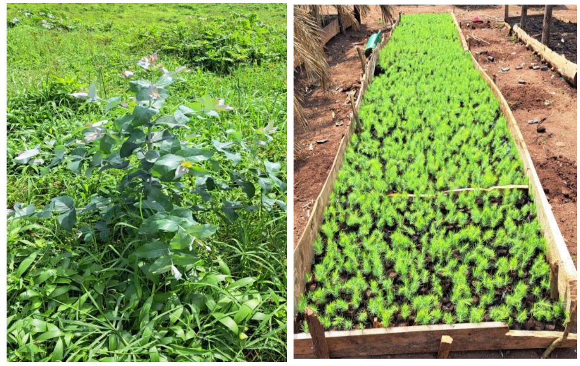
Globulous eucalyptus in Bugamba Reserve, Mbarara and seedlings ready for planting in Mwenge, Kyenjojo District