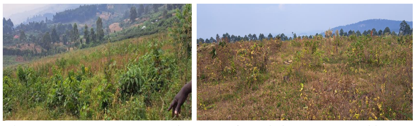
A newly planted bushy areas; the bush on one side was spayed after planting in Mwenge Range, Kyenjojo District

cumulatively from fires under NFA with survival above 70 percent; 863kgs of assorted seedlings were produced and supplied cumulatively by the NTSC.