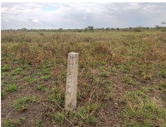
Left: Beehives for Ogwete Water and Environment Cooperative; Right: A restored section of Ogwete wetland in Otuke district formally degraded by some of the WEC members

Repayment of the revolving fund was ongoing in some of the catchments and the affected persons continue to borrow these funds and invest in environmentally friendly income-generating activities. In total 71km of soil and water management structures were constructed (e.g. infiltration trenches, contours, terraces etc. Under the Albert Water Management Zone (AWMZ), 8km of soil and water management structures were constructed in Rubanda District in Ruhezamyenda catchment, and 15 small water harvesting and flood control structures were constructed in Ruhezamyenda.