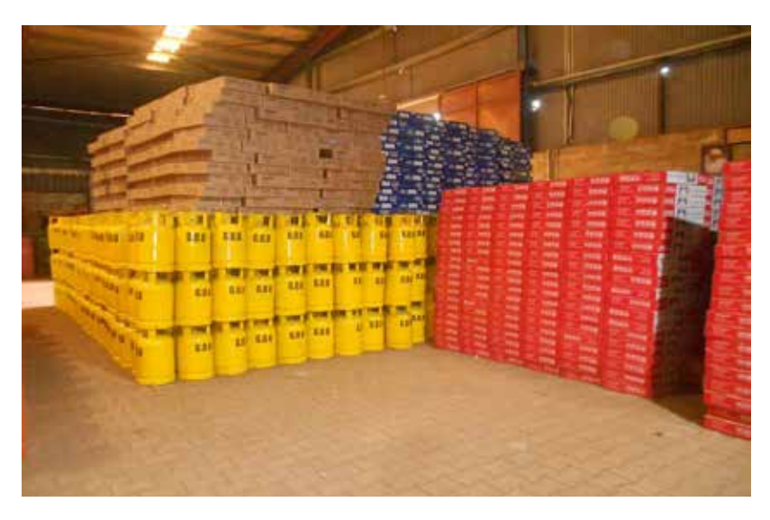
New GoU LPG cylinders at the Manufacturer's Namanve warehouse

The performance was good. total of 13,033 LPG promotional cylinder kits in the Central Region were distributed to various households during the FY. The refilling rate for the distributed cylinders was about 70%. Households that had acquired the cylinders were using LPG concurrently with biomass. Extensive distribution was hampered by low release (50.4%) with the distribution partners left with over 5,000 LPG pending household applications.